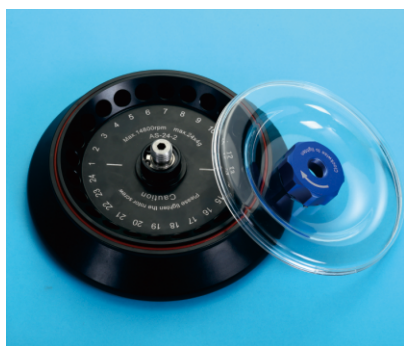
24 × 1.5ml/2.0ml rotor