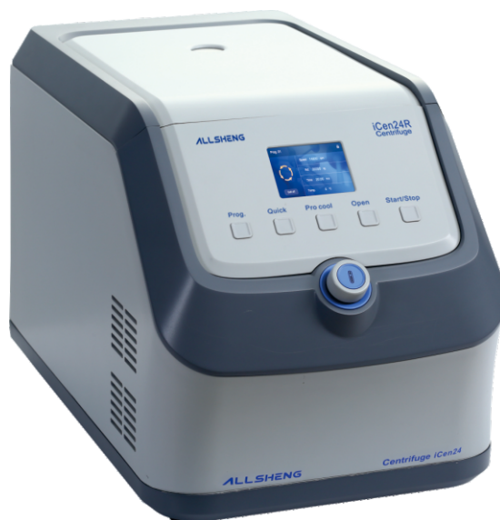
iCEN-24R Powerful refrigeration capacity