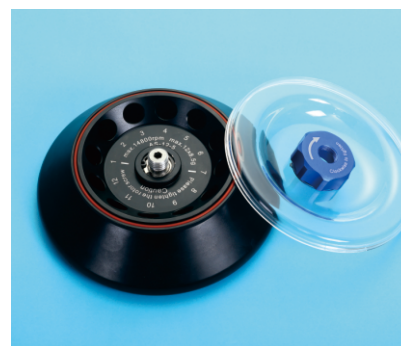
12 × 5ml rotor