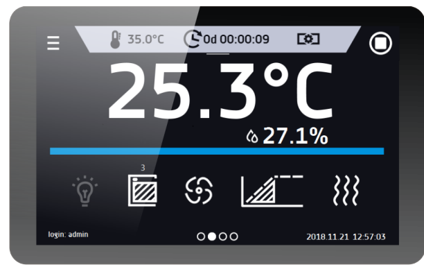
Smart PRO - preview screen