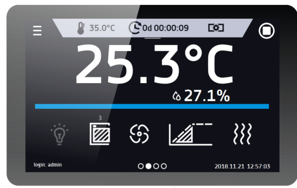
Smart PRO - preview screen