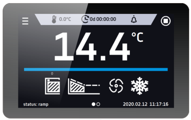
Smart - preview screen