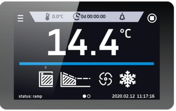
Smart - preview screen