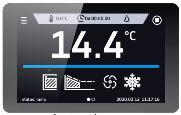
Smart - preview screen