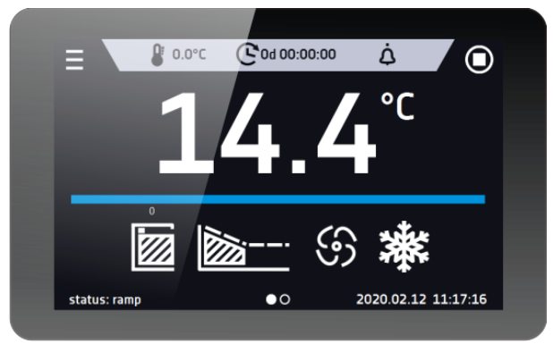
Smart - preview screen