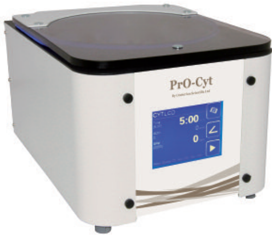
Display indicative only.