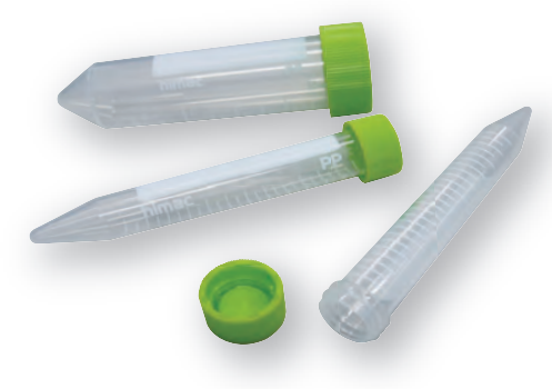
S311184A: himac 15TC TUBE (100pcs/set) S307904A: himac 50TC TUBE (300pcs/set)

* with R19A2 rotor for model CR30NX ** with R16A2 rotor for model CR30NX