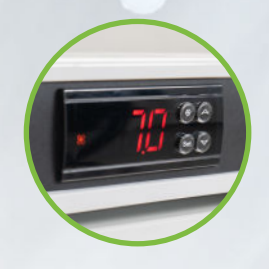
The digital controller features visual and acoustic alarms, high/low-temperature alarms, open-door alarms and a data logger.