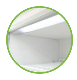
All models in our Flexaline range feature durable, cost saving LED lighting for better overview of your samples.